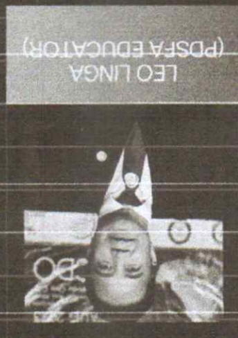
LEO LINGA (PDSFA EDUCATOR)