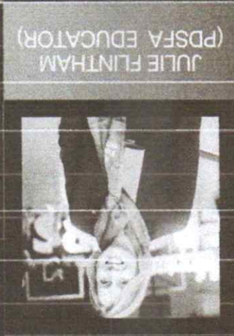
JULIE FLINTHAM (PDSFA EDUCATOR)