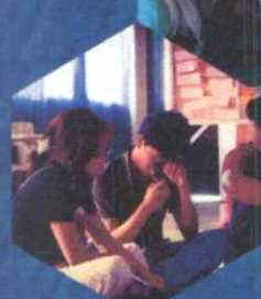
Mental Health Awareness Campaign