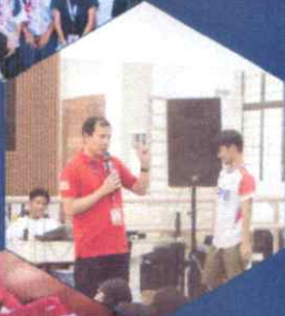
HIV& AID Substance Abuse Program (HASAP)