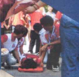
School-Based DRR and Climate Change Adaptation Course