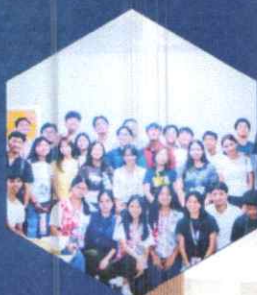
Youth Volunteer Formation Course (YVFC)