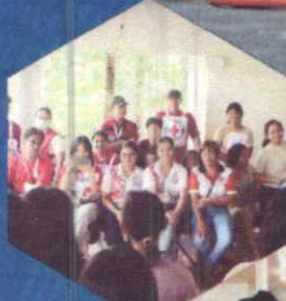
Child Protection Policy (CPP)