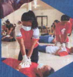
First Aid Lecture and Demonstration