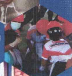
Red Cross Youth First Aid Training